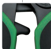
• Quick Release