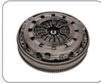
Ten Alignment Adapter