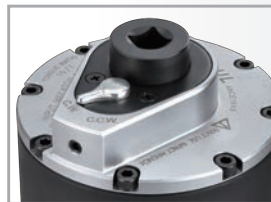
Anti Backlash Device