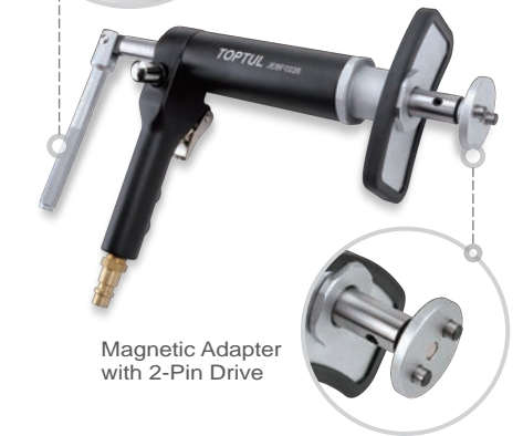
Magnetic Adapter with 2-Pin Drive